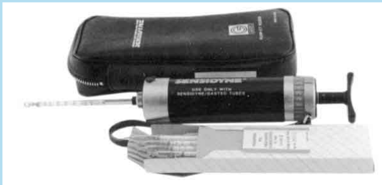
HSG-GD400 Gas Detector, Carrying Case and Detector Tubes

Series HSG-GD400 Gas Detector is a precision instrument which permits immediate, reliable determination of the presence and concentrations of numerous gas and vapors. It consists of a piston-type volumetric pump into which direct-reading detector tubes are inserted. Analysis is based on chemical reaction of a reagent in the detector tubes with the gas or vapor samples. Measurement is indicated by the length of stain appearing in the tube.